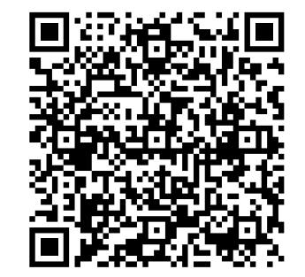
Scan here for more info.